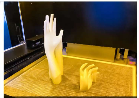
Art Design Parts